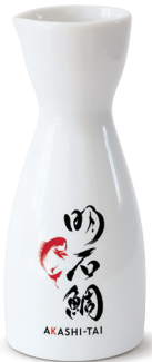
AKASHI-TAI SAKE FLASK 125ml