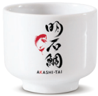
AKASHI-TAI SAKE CUP