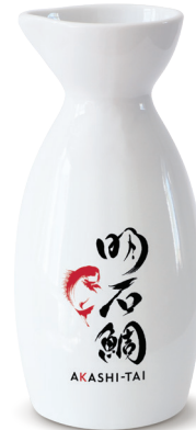
AKASHI-TAI SAKE FLASK 300ml