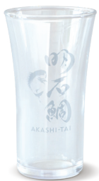
AKASHI-TAI SAKE GLASS 115ml