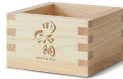
AKASHI-TAI WOODEN MASU CUP