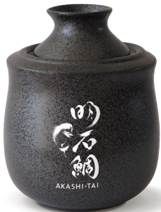
AKASHI-TAI POTTERY SAKE WARMER/COOLER